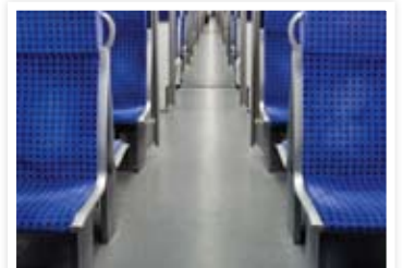
Passenger Rail Cars