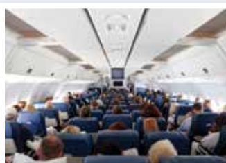
Aerospace – Noise Control with High Temperature Flame Resistance