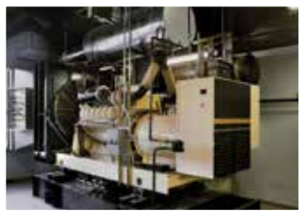
Industrial and Construction Equipment

DURA-SONIC is widely used to control noise in: