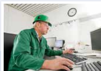
Workspaces – Manufacturing and Plant Offices