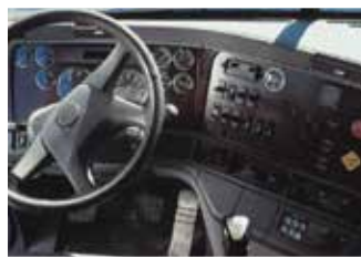
Vehicle and Cab Interiors