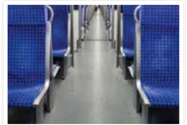
Passenger Rail Cars